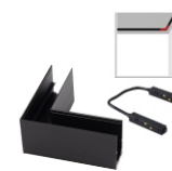
90° L1 Corner