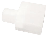
End cap with hole