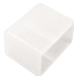
End cap without hole